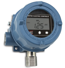
ONE SERIES 1XSWLL