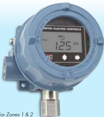
For Zones 1 & 2