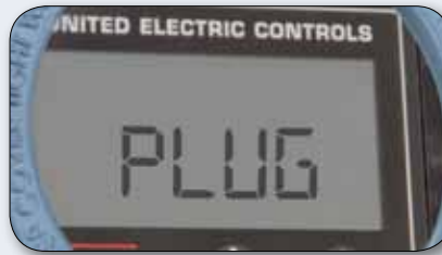
Diagnostics example: detecting plugged port